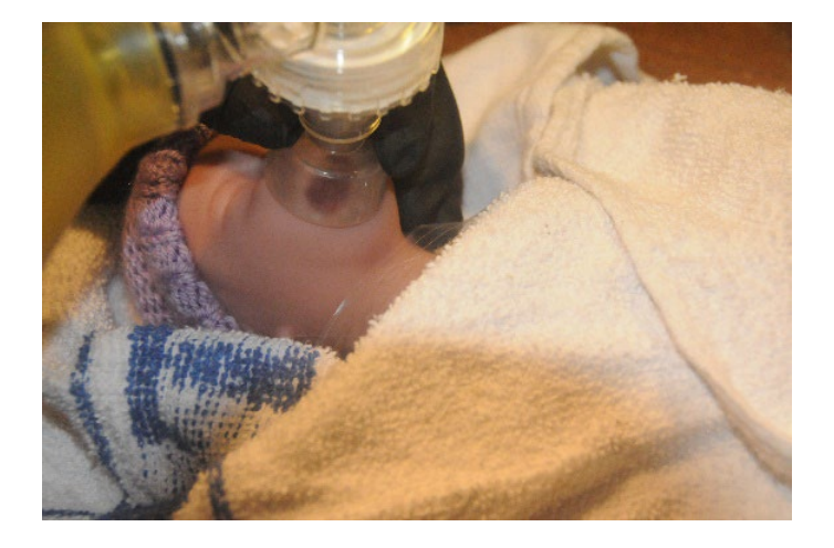
Figure 4 – Bag mask ventilation (head in neutral position)