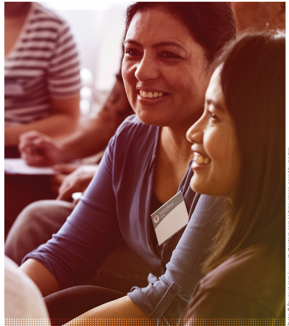
Library image, posed by models

One participant compared release to a black hole into which all the mental health support they could access in prison dissolved. This was echoed by respondents to Clinks’ survey of our members conducted