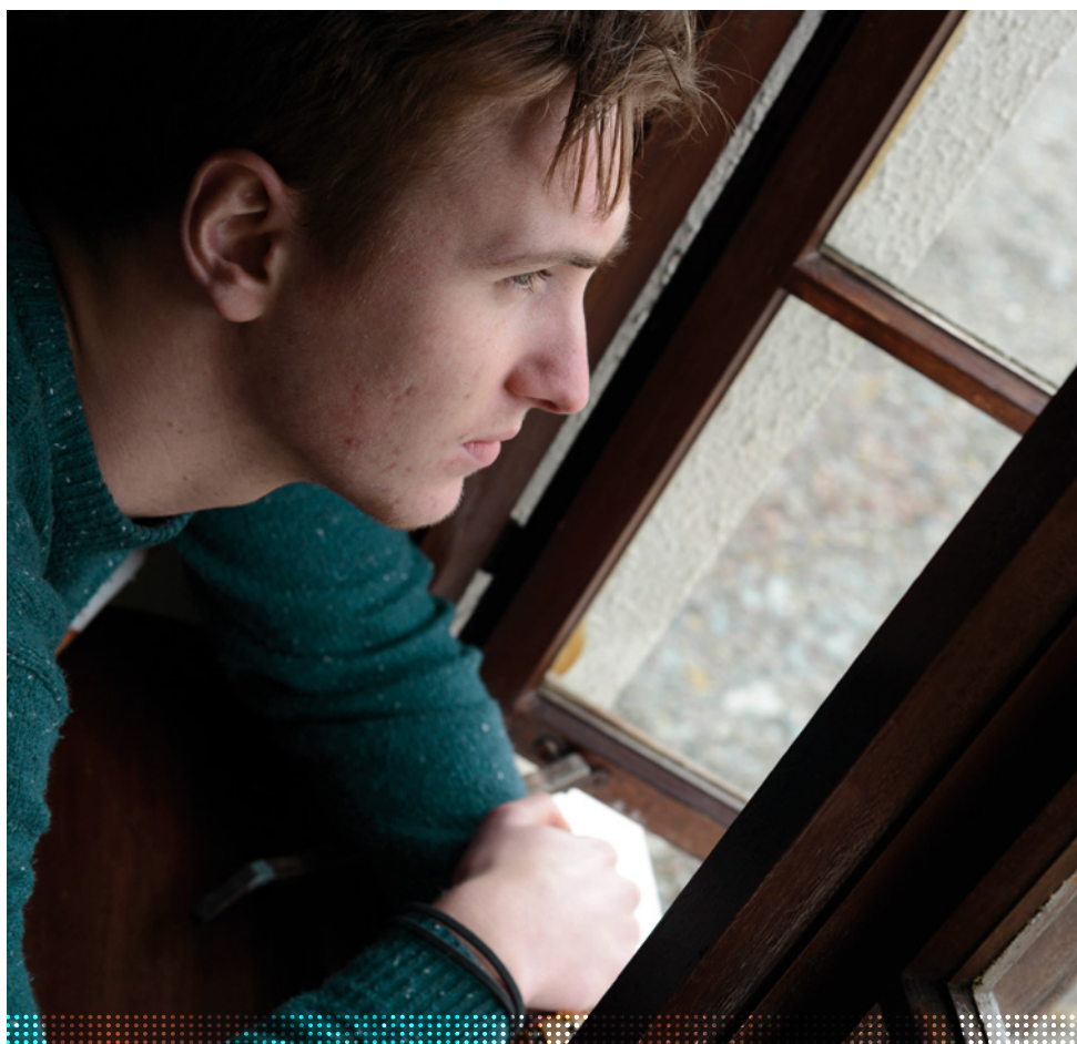
Library image, posed by model

Different methods and formats for communication (written, signing, visual, verbal, or a combination of these) should be available depending on the person's preferences, and easy read forms should be provided as standard alongside all written information.