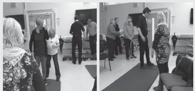
Participants practicing walking on the mat to challenge/improve their balance

There were physical benefits, and patients showed improvement in their walking, balance, use of arm for various activities of daily living. In addition, other perceived benefits from participants' point of view were – improved socialisation, motivation, confidence, and support."