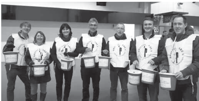
BASF staff, trustees & volunteers at Ashton Gate Stadium