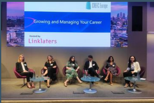
Women's Educational Event

Sponsor the Champagne Reception at our prestigious black-tie 2025 industry dinner at The OWO.