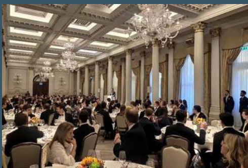
Industry Dinner 2024- Langham Hotel