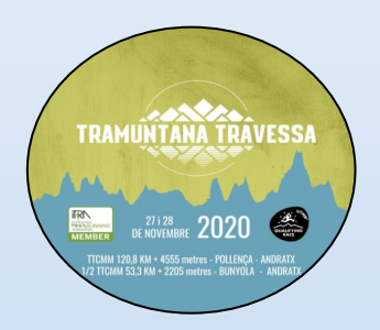
Tramuntana Travessa 2020 - CANCELLED

From the ashes of these two disappointments was born Mallorca Odyssey.