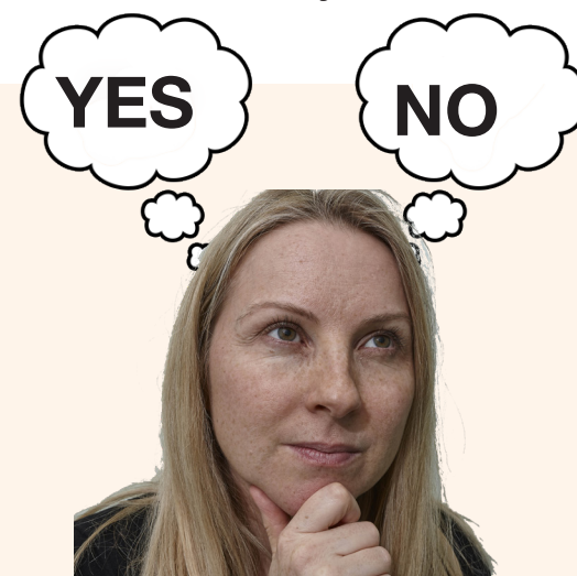
Choice 1: You can have no more tests.

You can ask your midwife questions at any time.