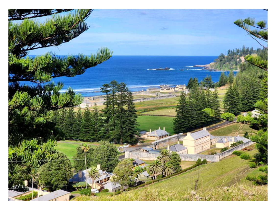
Day 3 Wednesday 10 April 2024