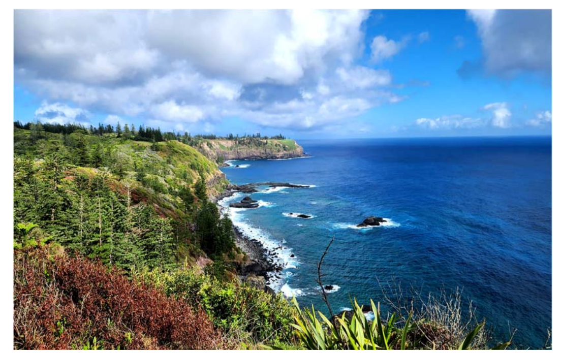
Day 6 Saturday 13 April 2024