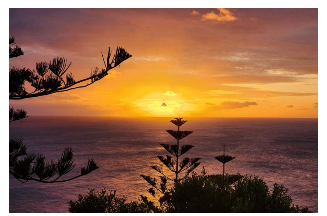
Day 2 Tuesday 9 April 2024