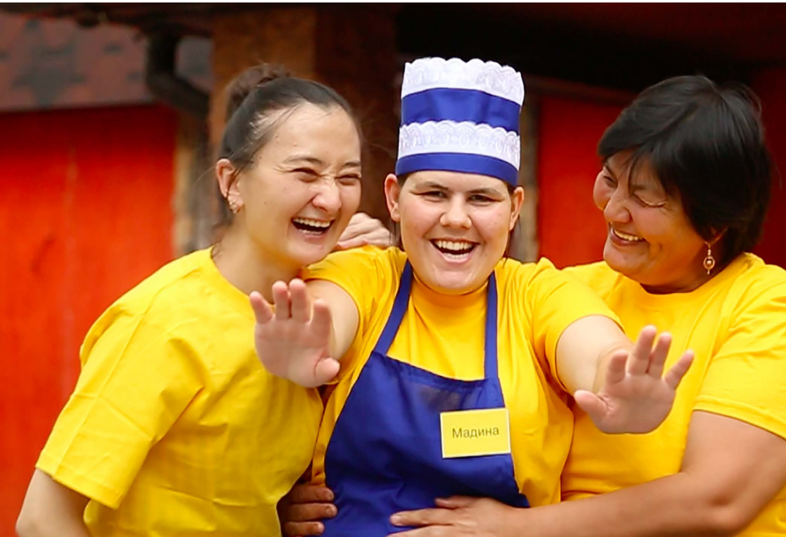
Young staff at the Training Café, Almaty, Kazakhstan (see page 13)