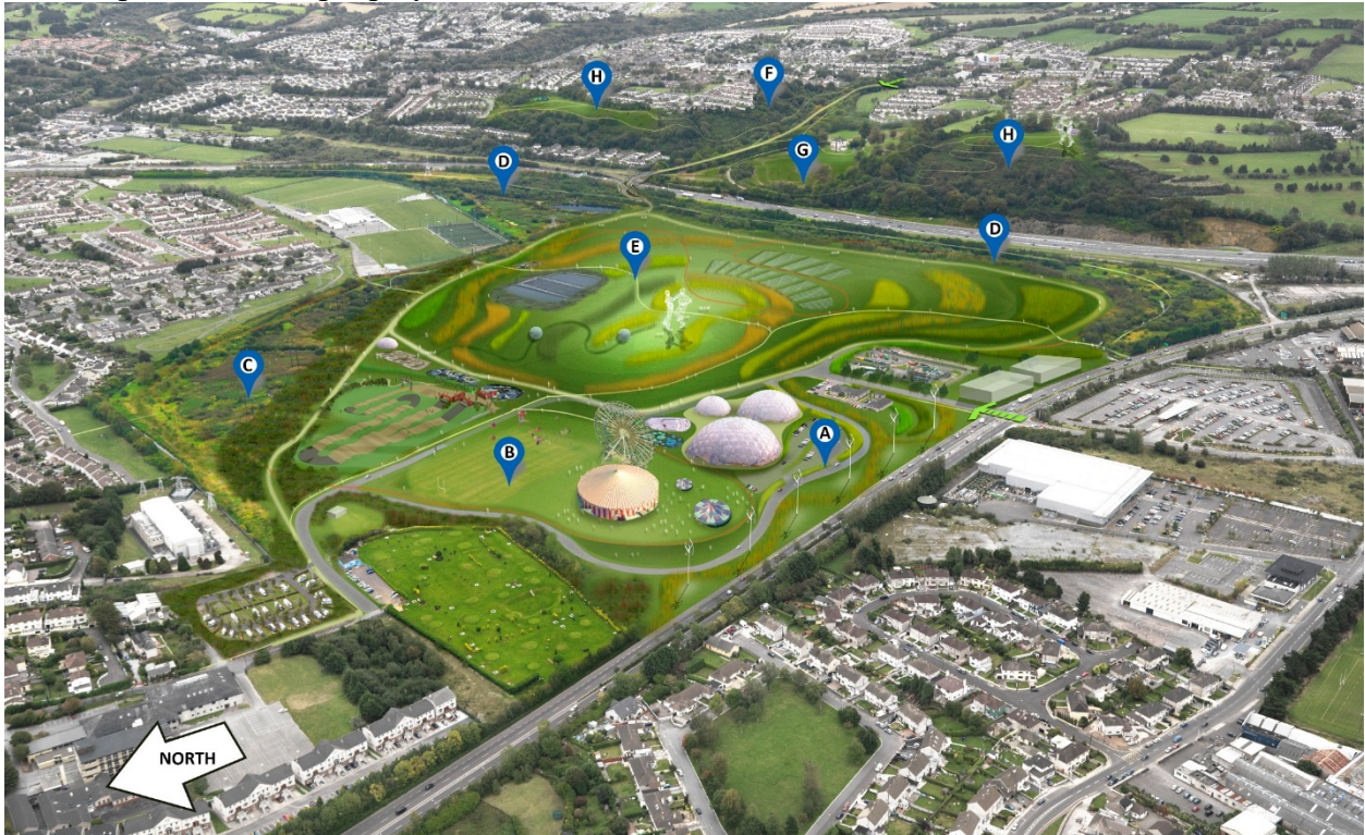
Figure 2. Aerial Perspective of Tramore Valley Park (Zones A – H inset)