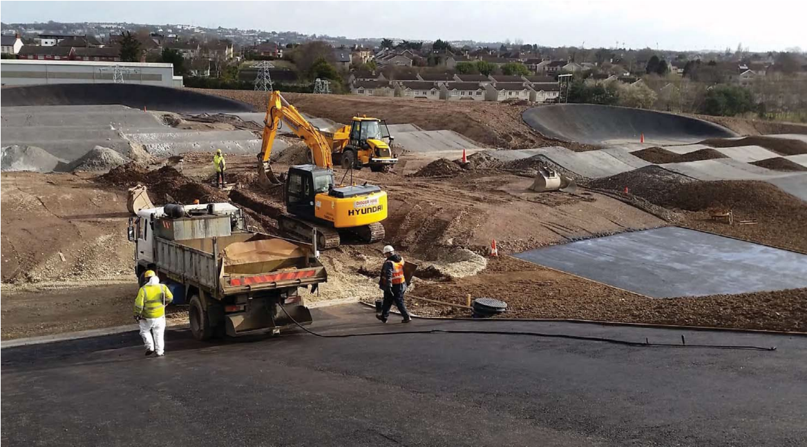
Figure 6. BMX track under construction (April 2015)