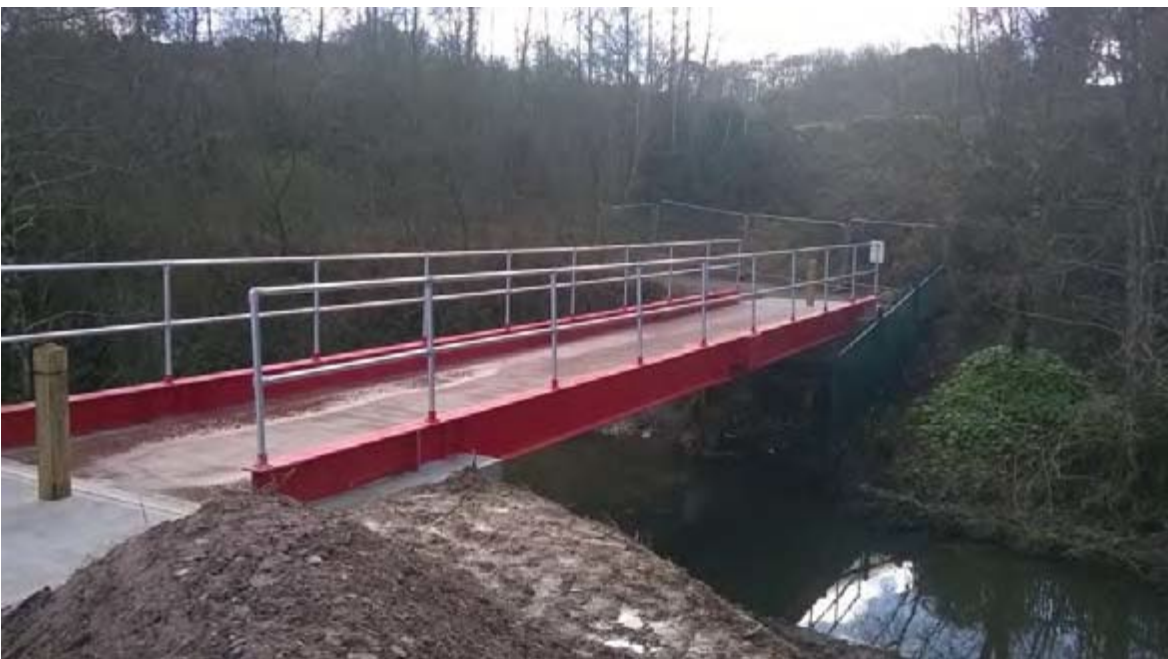
Figure 7. Reuse of the old weighbridge linking the park to the eastern river walkway