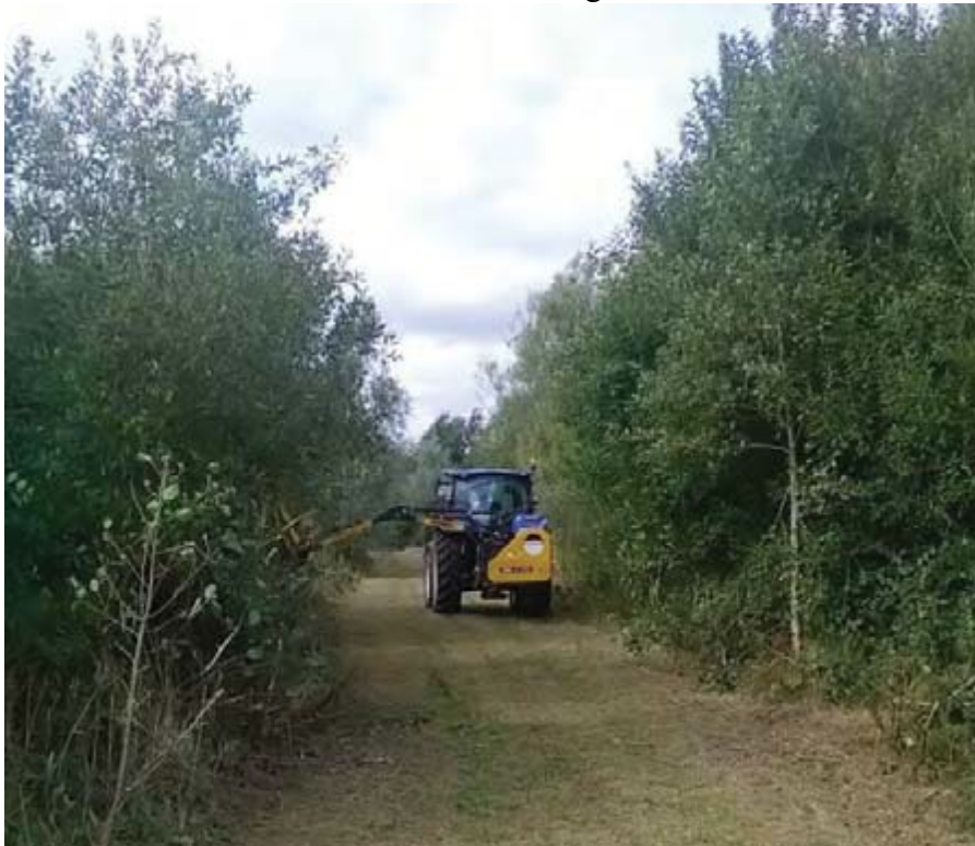
Figure 5. Upgraded Woodland Walk at Tramore Valley Park