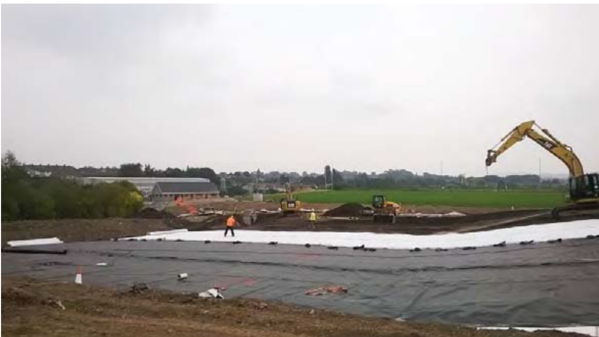
Figure 4. Installation of the LLDPE Liner, October 2014