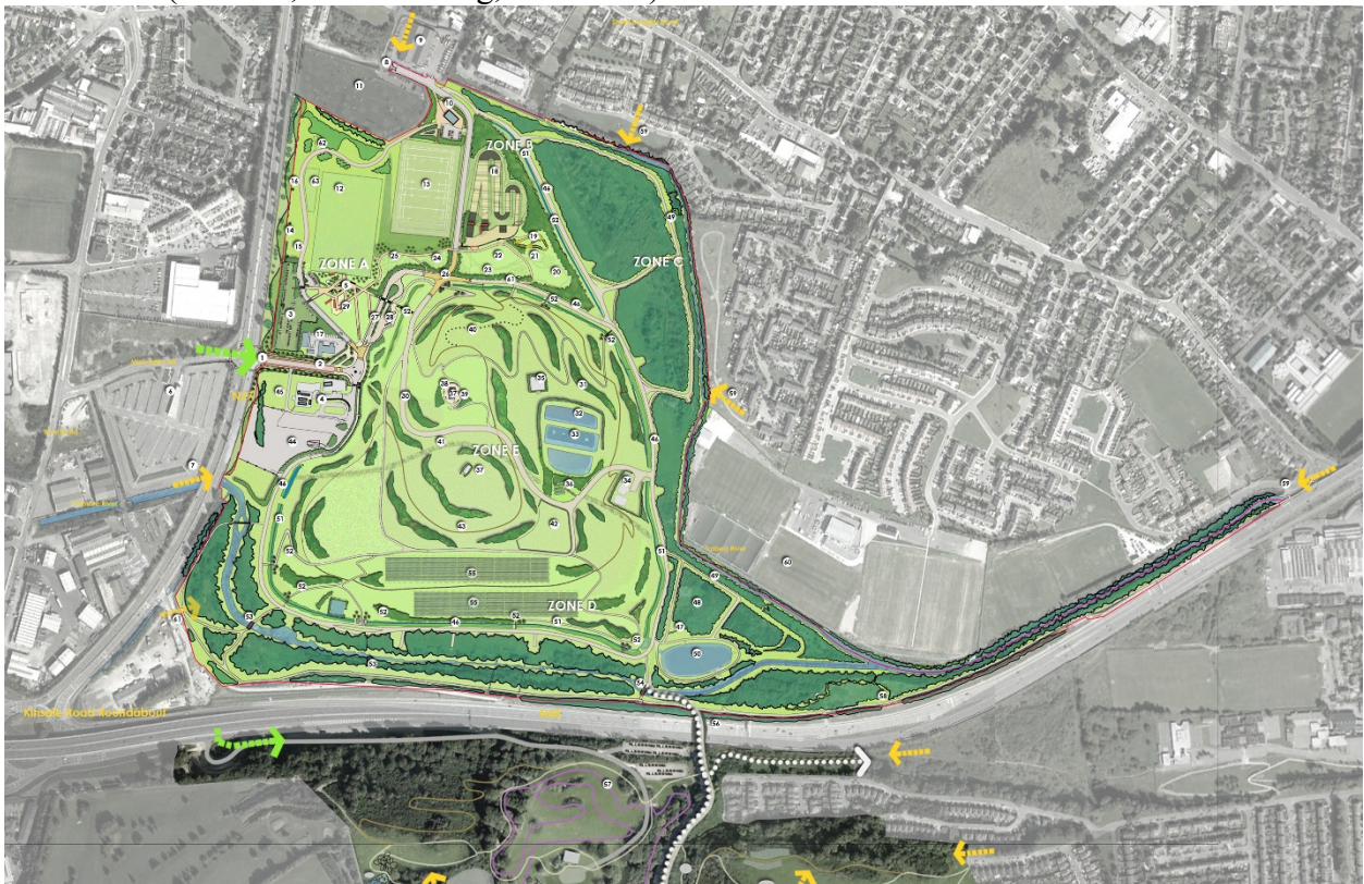
Figure 8. Overall master plan

For year one it is likely that the green elements (grass areas and trails) will be managed using internal City Council resources with a third sector Leisure Operator taking responsibility for special events (circuses, track running, BMX etc.).