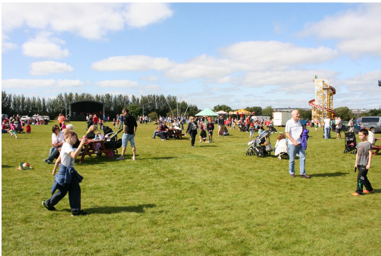
Figure 8. Multi-use events area at Tramore Valley Park, September 2015