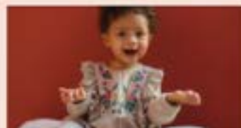
Singing nursery rhyme lyrics with babies and children

Lyrics, actions and melodies to popular nursery