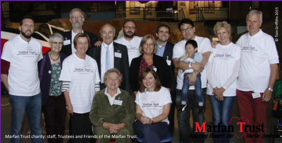
Marfan Trust charity: staff, Trustees and Friends of the Marfan Trust.