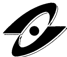
the Guidance Council

sponsored by the Department for Education and Employment