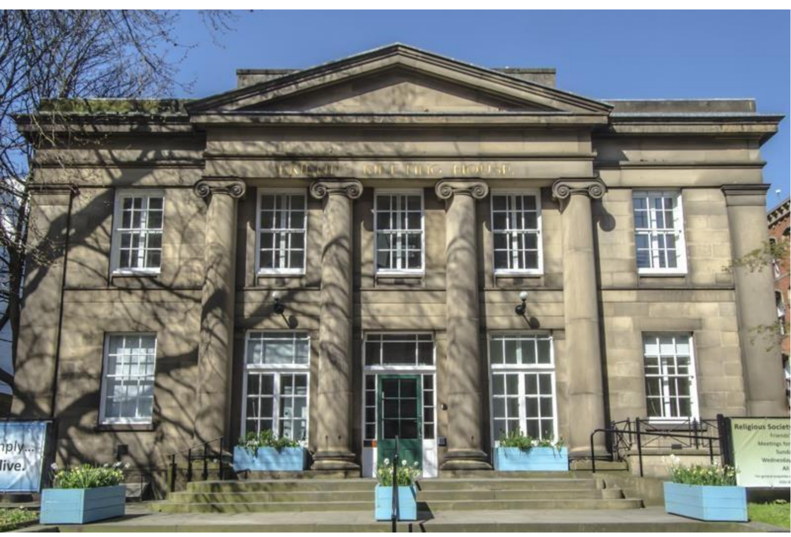
Welcome to Friends' Meeting House. We are looking forward to your visit. Here are a few things which may help you on your visit to our conference centre.