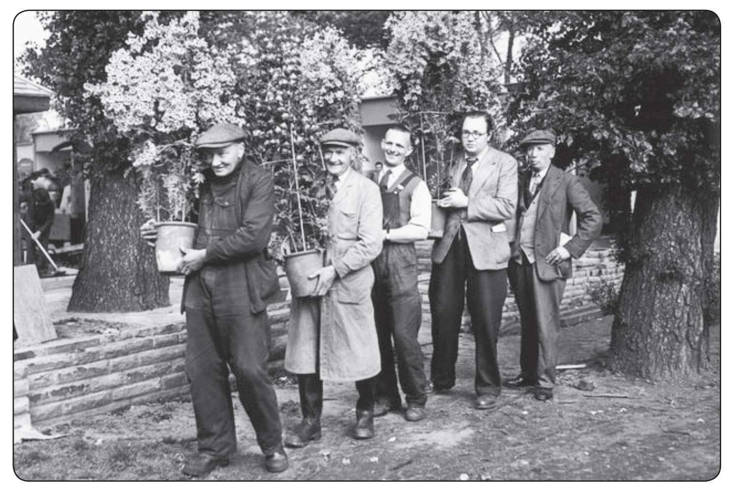
Exhibitors Preparing for the Show

Strawberries, gooseberries, black and red currants etc. were grown in abundance in the fields around Burnfoot for many decades in the early part of this century. Large numbers were employed as fruit-pickers, squad supervisors etc. in the summer months. The photograph is of some employees at the fruit-picking at Burnfoot having an outing to fillietudlem Castle in the 1920's.