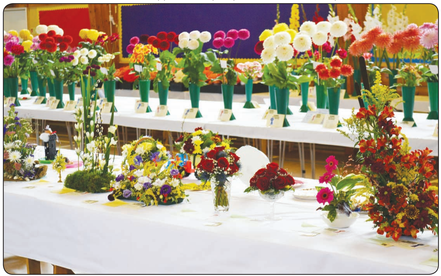
Flowers and Floral Art from The Flower Show 2019

The Committee wish to express their thanks to all patrons and members of the public for their continued support and by way of donations and help.