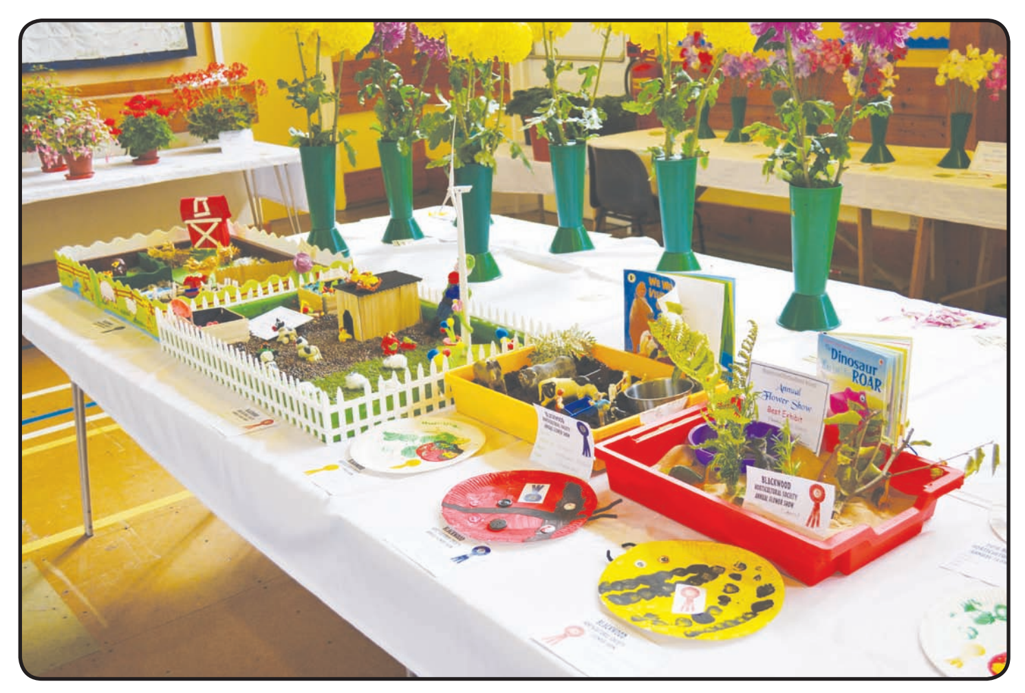
Inter Schools Presentation from 2018