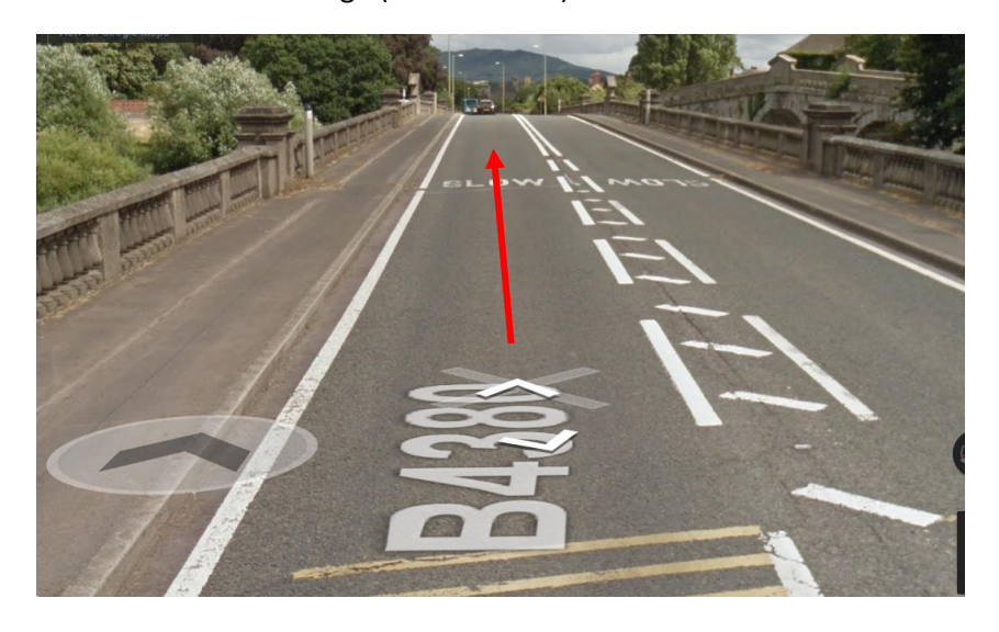
Turn right into Malthouse Lane