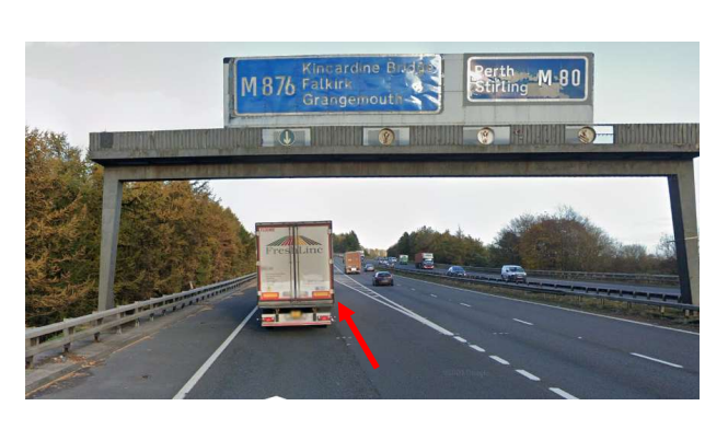
3) turn left signposted Falkirk, Bonnybridge A883