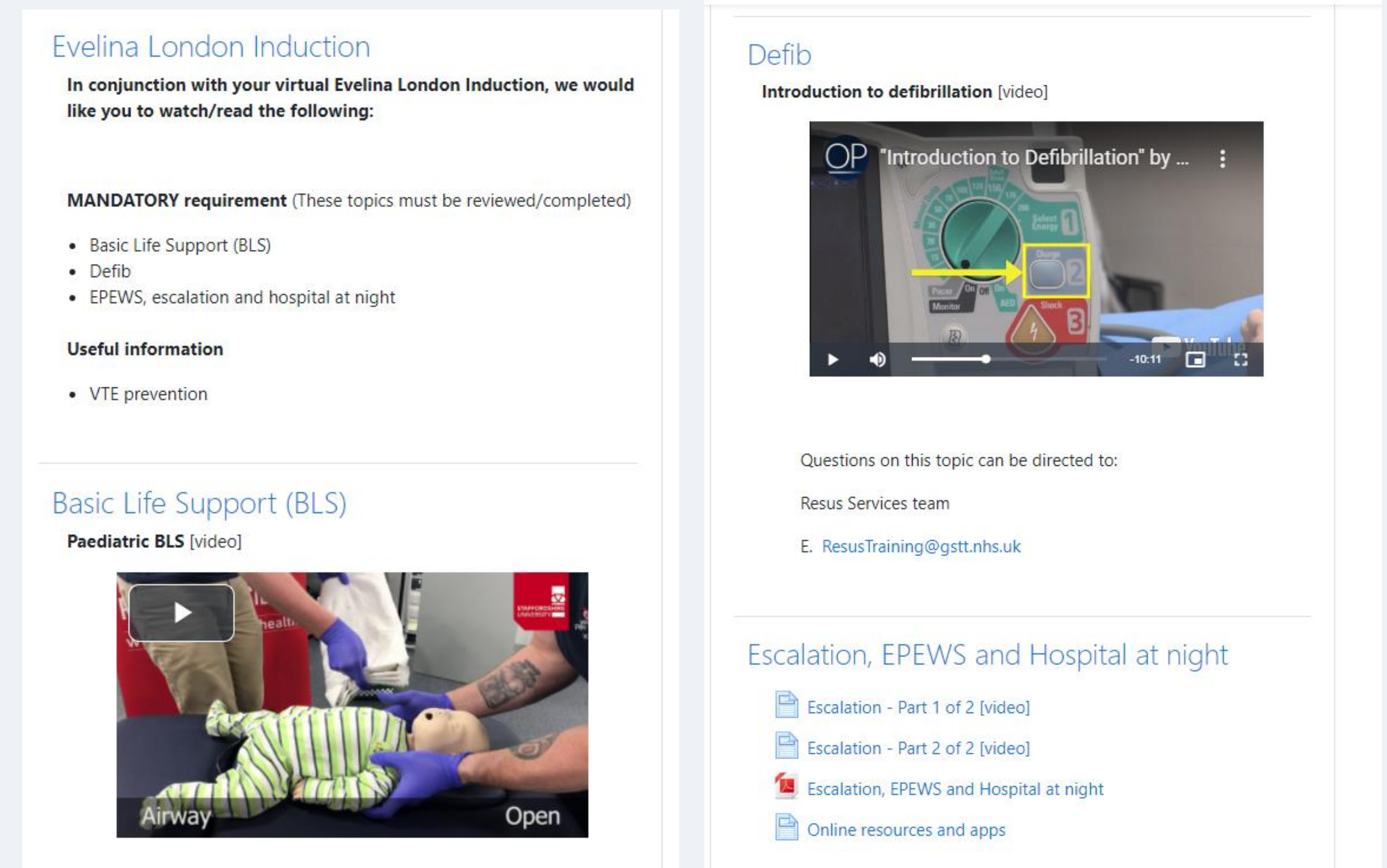
Examples of the resources and materials on the ocean2sky.uk Paediatric Induction Page.

From white space answers we found Education Leads and Course Organisers were felt to be more accessible than during previous inductions.