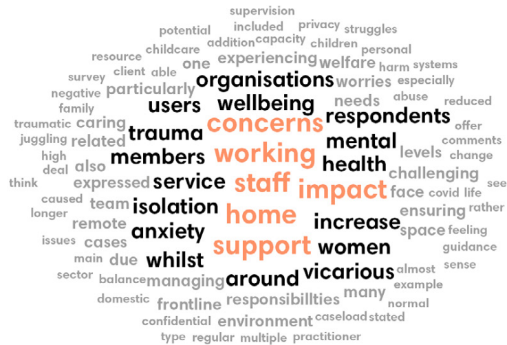
Figure 1: Word cloud showing most frequent terms in literature discussing the impact of the pandemic on the domestic abuse workforce

out personal rotas and systems with partners to ensure that childcare and privacy is resolved.” [25] With everyone at home, some survivors contacted services late into the night when they were free from family responsibilities, which in turn meant that services and staff had to be accessible during longer, less sociable hours.