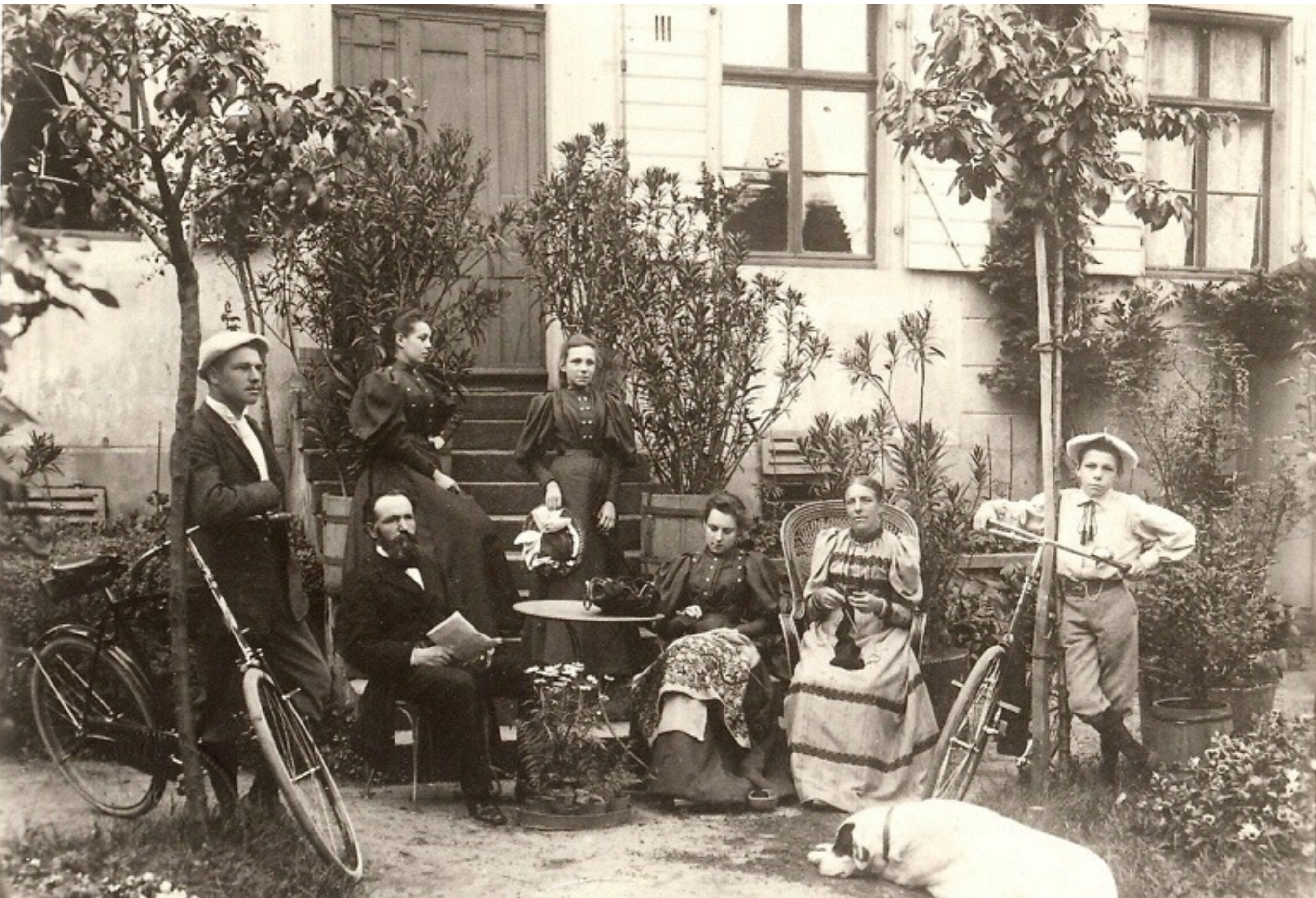
Born in 1875 in the Alsace, here he is aged 16 or so, with his family.