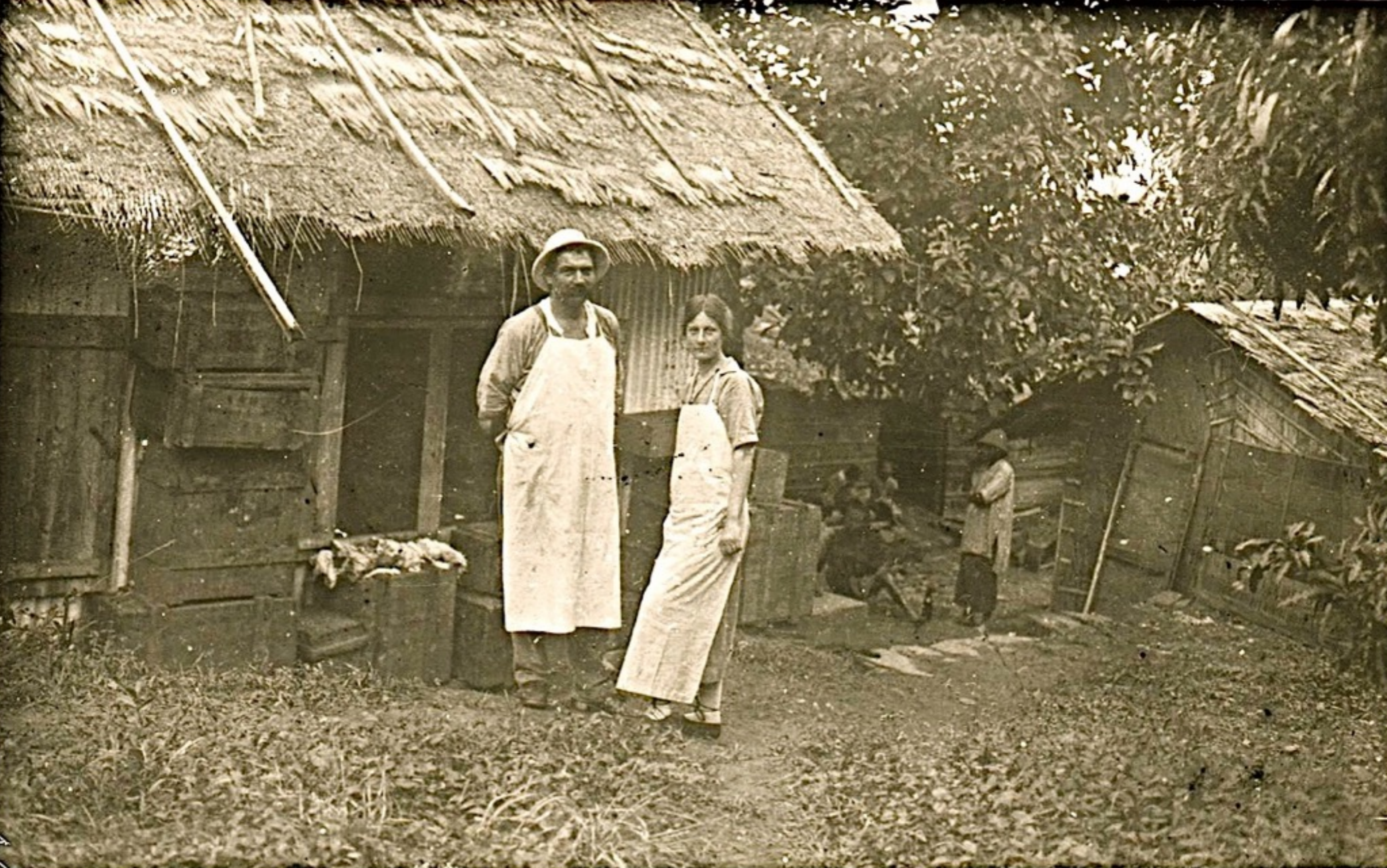
They started treating their first patients in a chicken coup.