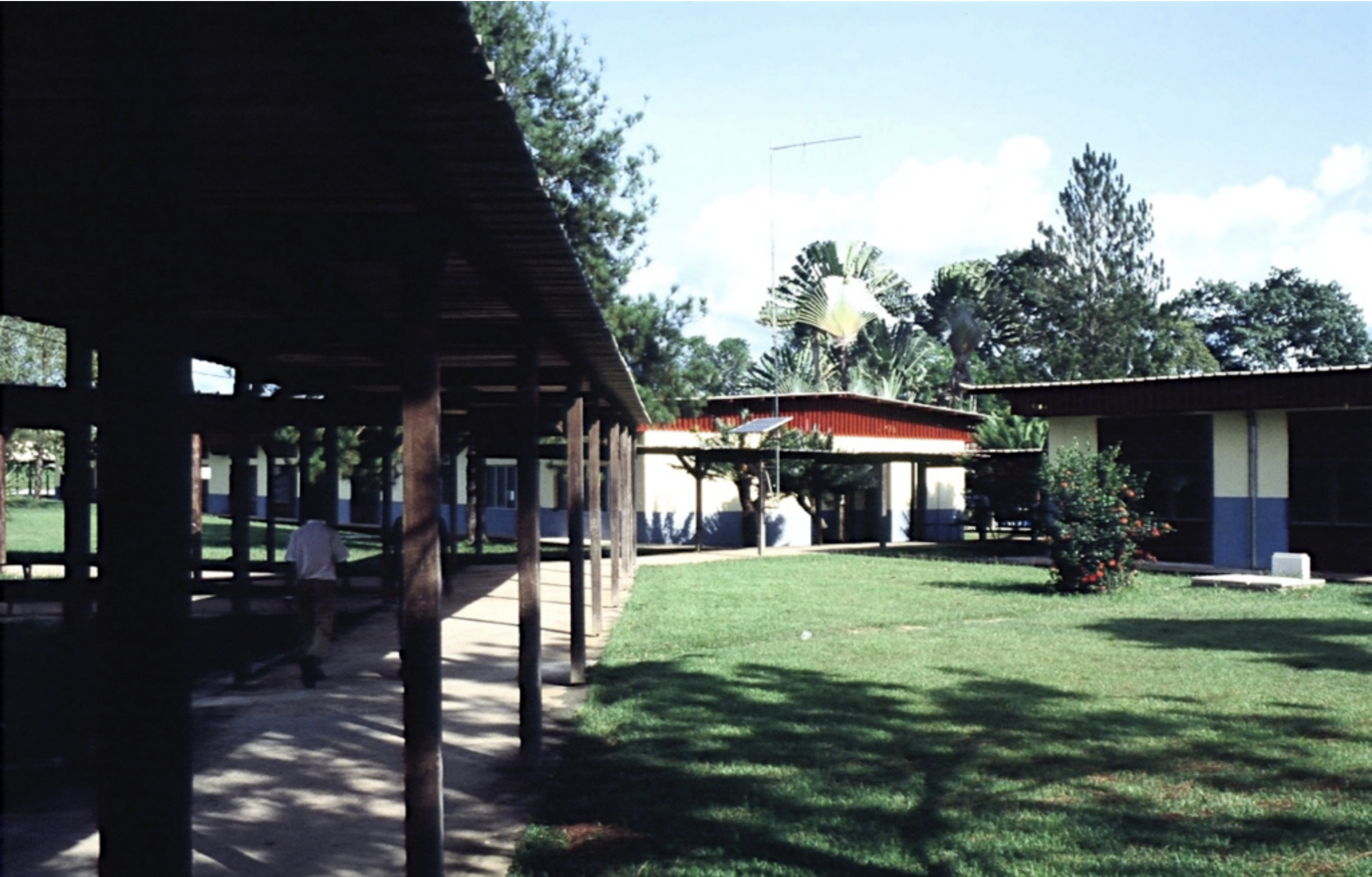
The Lambarene hospital Schweitzer founded continues to flourish – here is the maternity unit in 2003.