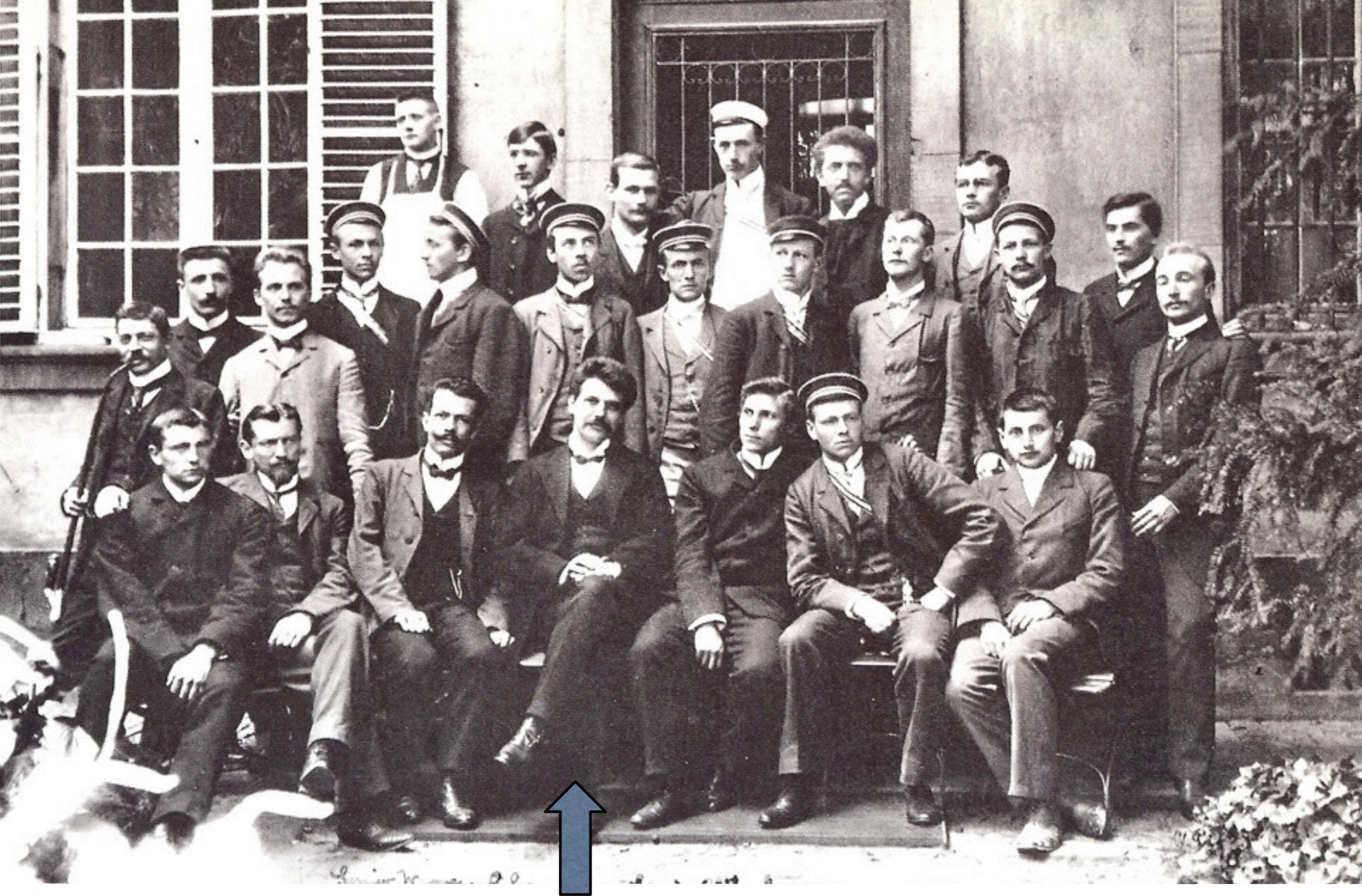
Here you see the 29 year old university professor of philosophy and theology and housemaster with his students.