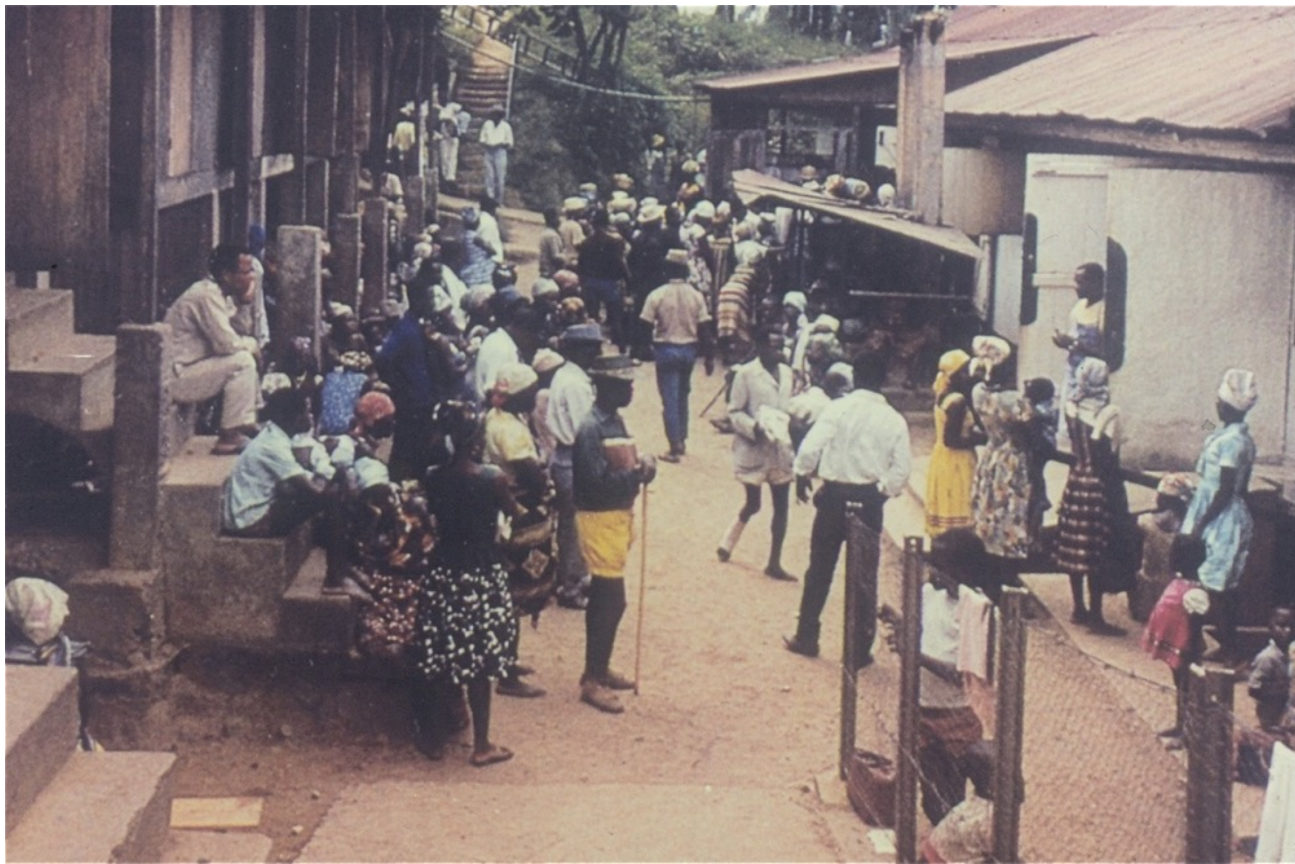
A typical scene in Lambarene hospital in 1963.