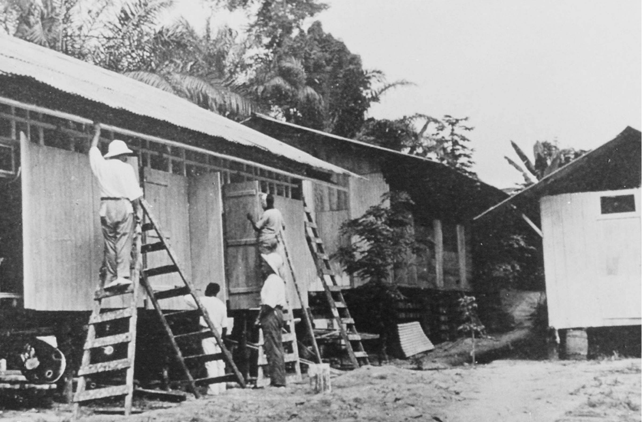
Albert Schweitzer the builder up on the ladder.