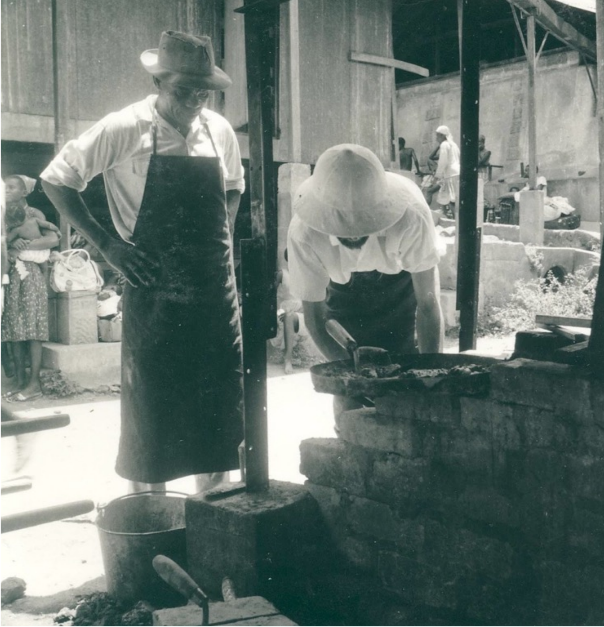
Reconstructing a stove for boiling hospital linen.