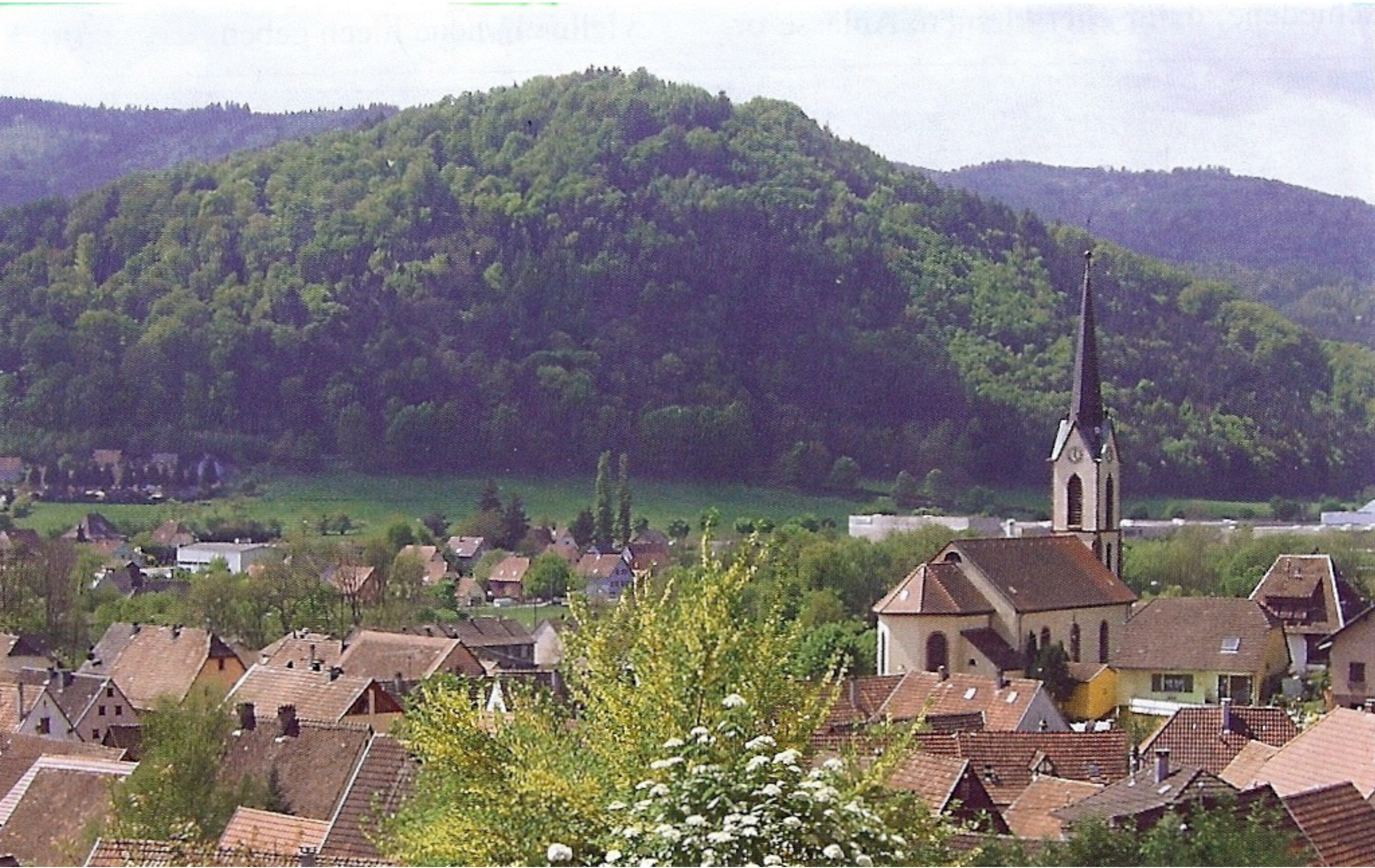
The green valley and the village of Günsbach where Albert grew up.