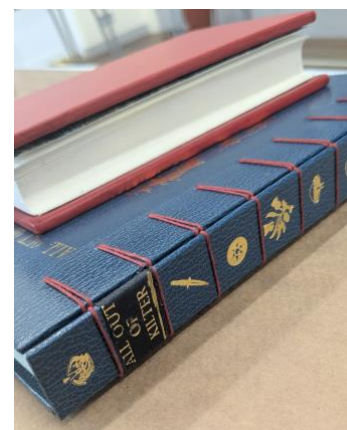
Show & tell