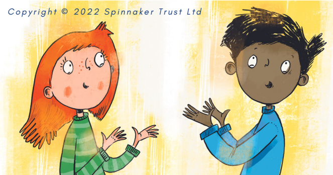
'Jesus Teaches Us How to Pray' - 'It's Jesus!' Resource