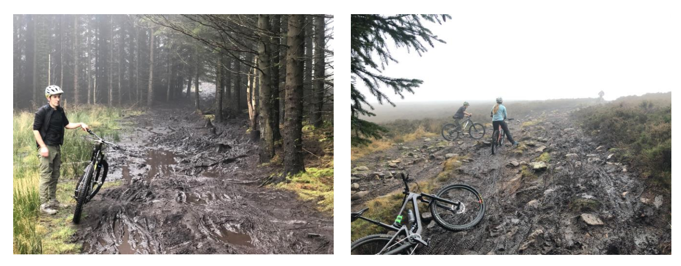
Sections of the multi-use path proposed for upgrading at Caberston

The plans for the climb currently sit with Scottish Borders Council for planning permission while the employed project manager deals with pricing tenders etc.