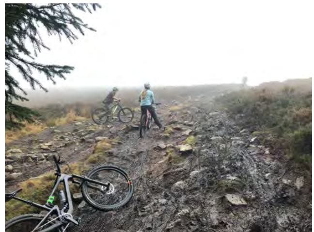
Sections of the multi-use path proposed for upgrading at Caberston

Proposed project plan included overleaf.