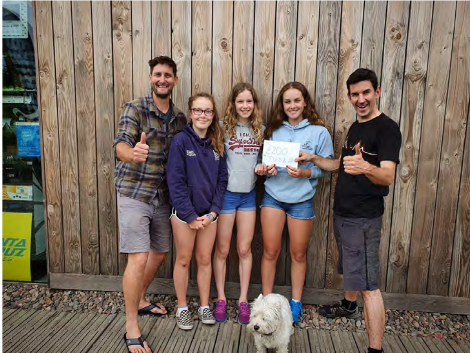
PCC riders donate £200 raised from the cake stall at the annual Stage Race